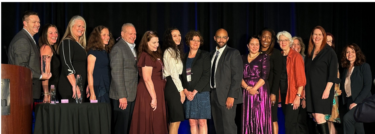
Photo: CM Law Receiving the NAMWOLF Law Firm of the Year Award